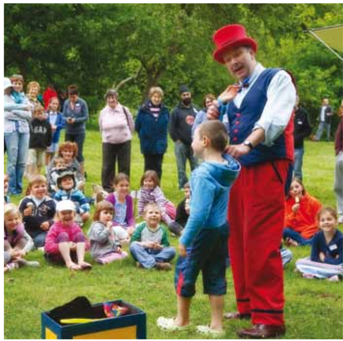
Families enjoy the entertainment at last year's event.