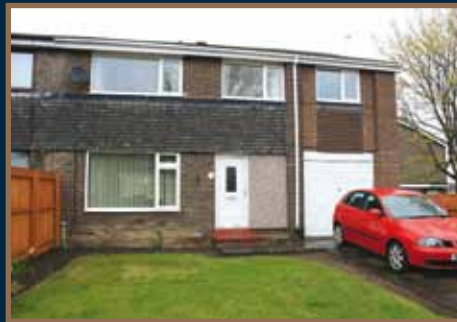
Rowan Drive, Ponteland