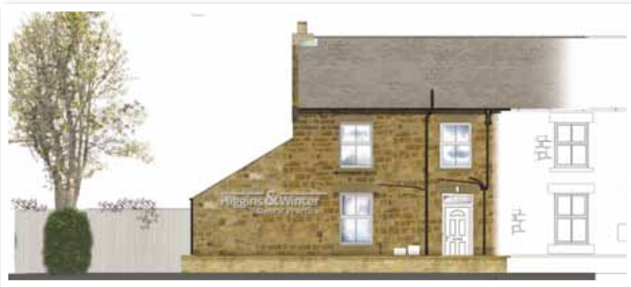
An artists' impression of the new surgery entrance

Developers have submitted a second appeal and a county council spokesman said the hearing date had now been set: “The Planning Inspectorate have confirmed that the planning appeal hearing will be heard on Wednesday 30th May in the Council Chamber, Prospect House, Hexham, starting at 10am.”