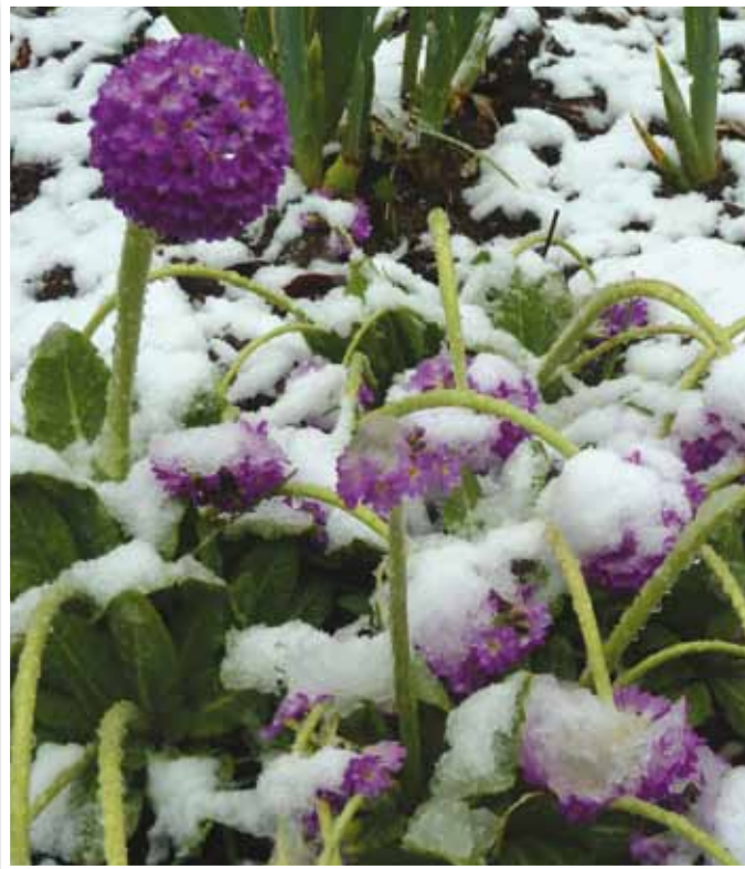
The weather changed and blizzard conditions swept the county on 3 April. The spring blooms were weighted down with the wet snow.