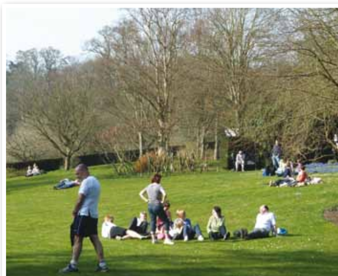
Families picnicked and played in the walled gardens at Wallington.

The warm temperatures and blue skies in March lifted the spirits and brought out the gardeners, the walkers and the tourists. The County Council had organised free entry to some of our major attractions on a glorious weekend, as trailed in the March PNV, and county residents came out in their thousands to experience some fantastic offerings.