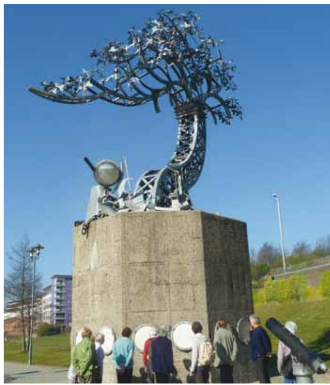
Ponteland USA walkers admired the variety of sculpture on the Wearside sculpture trail at Sunderland.