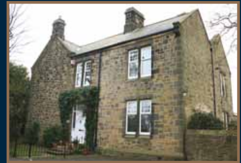
Whorlton Old Rectory, Whorlton