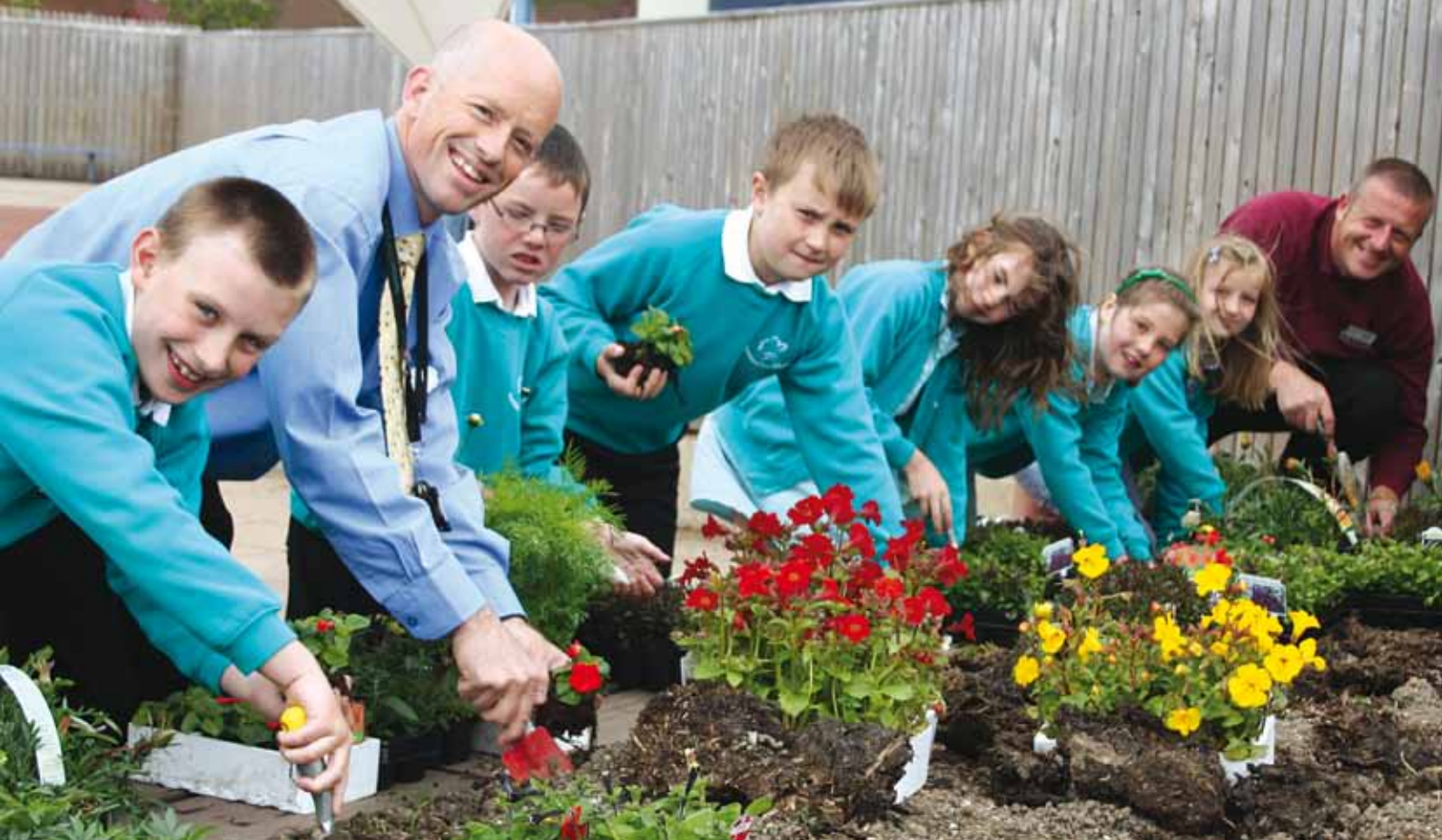
Gardening club students plant the flowers donated by Cowells Garden Centre